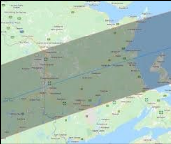
Path of totality in New Brunswick, Canada

On Monday April 8th we will have a once in a lifetime opportunity to witness a total Solar eclipse in New Brunswick. The central part of the province will be in the direct path of totality for the first time since the year 932! This means